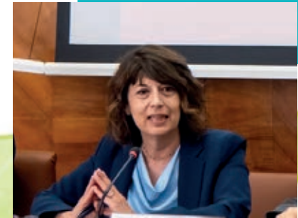
Roberta Angelilli Vice President, Lazio Region